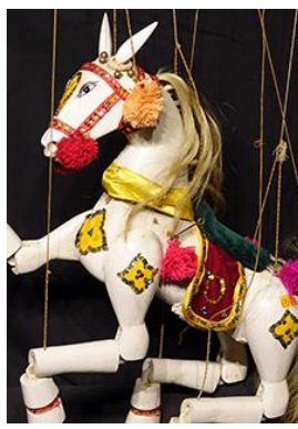
Horse; Yokthe Pwe string puppet, Myanmar